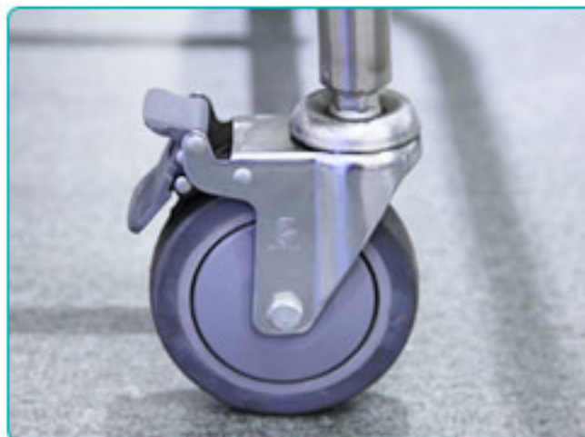
5"casters with brake Deluxe mute wheel