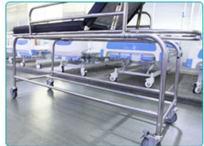
Stainless steel frame Clean is not easy to rust